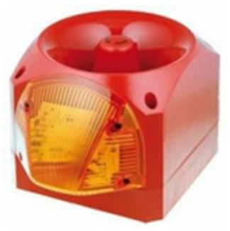
Nexus 105 Siren w. orange flash Power consumption max 1.6watt

The sensor can be connected directly to a siren using the Alarm A, Alarm B, Alarm C and ground. At the same time the mA signal can be send to a PLC