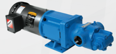
(H495 M Drive)